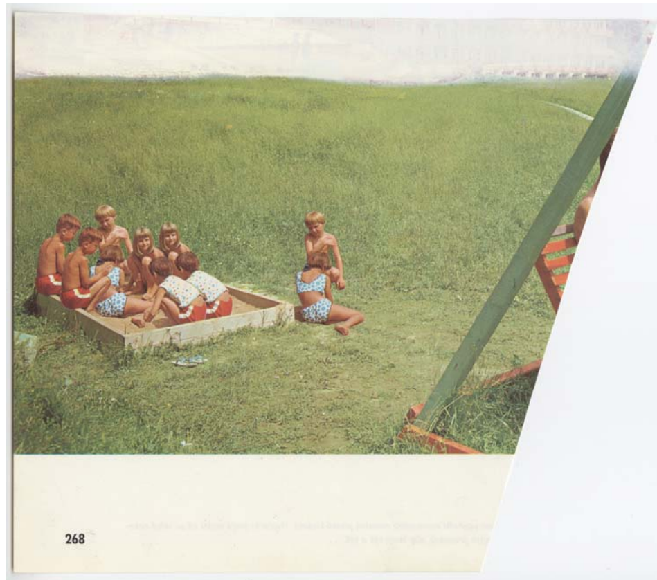
Svätopluk Mikyta, PLUS, mixed media on paper, 2013