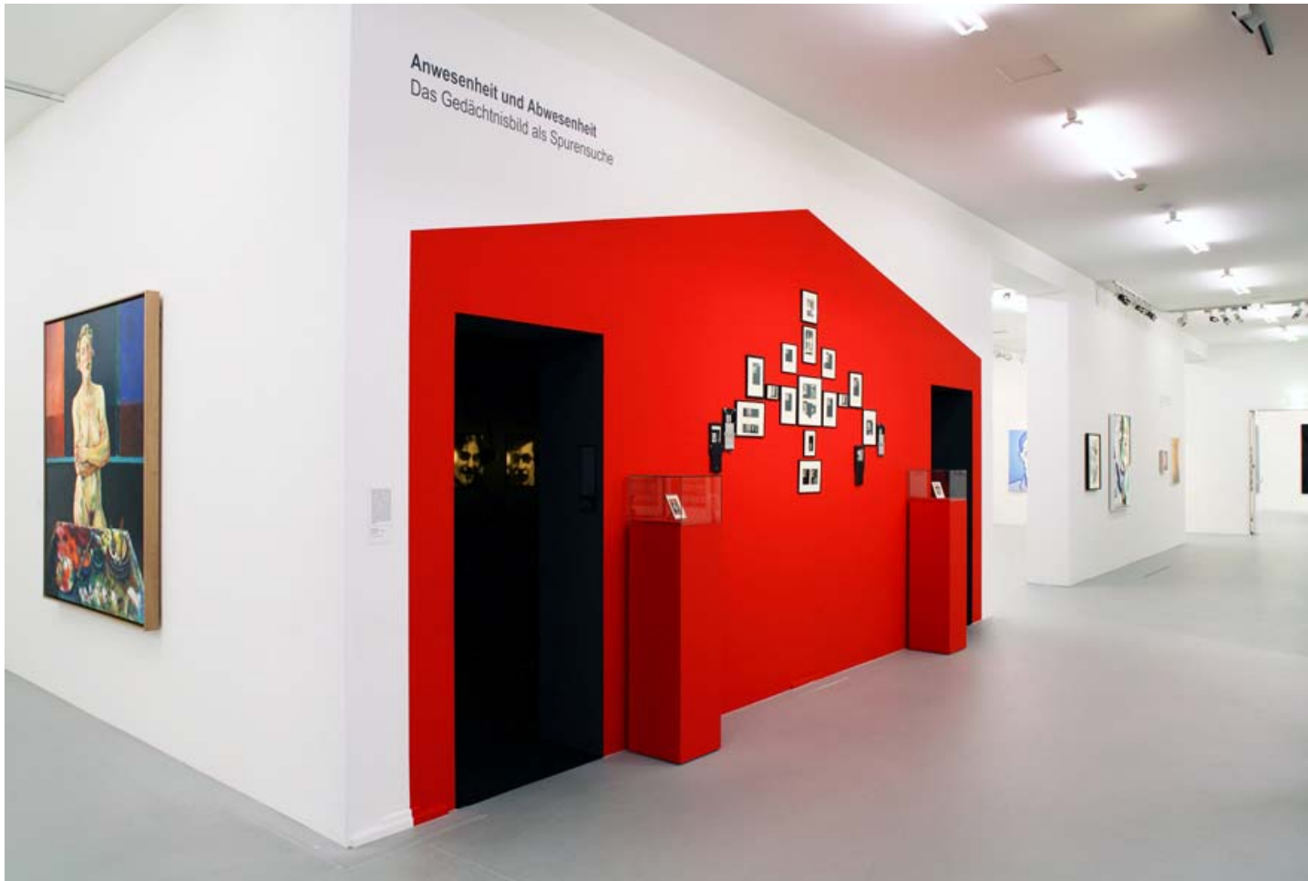
Svätopluk Mikyta, installation view, Kunsthalle Krams, 2009