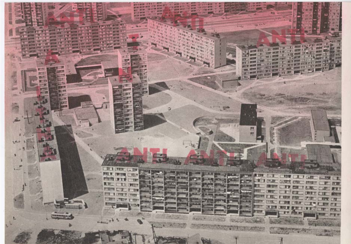
Svätopluk Mikyta, ANTI, mixed media on paper, 2013

K R O K U S Galéria s.r.o., Námestie 1. mája 3, SK-811 06 Bratislava T/F + 00421 (0)2 207 28 131, office@krokusgaleria.sk, www.krokusgaleria.sk Open Mo.-Fr. 14.00-18.00