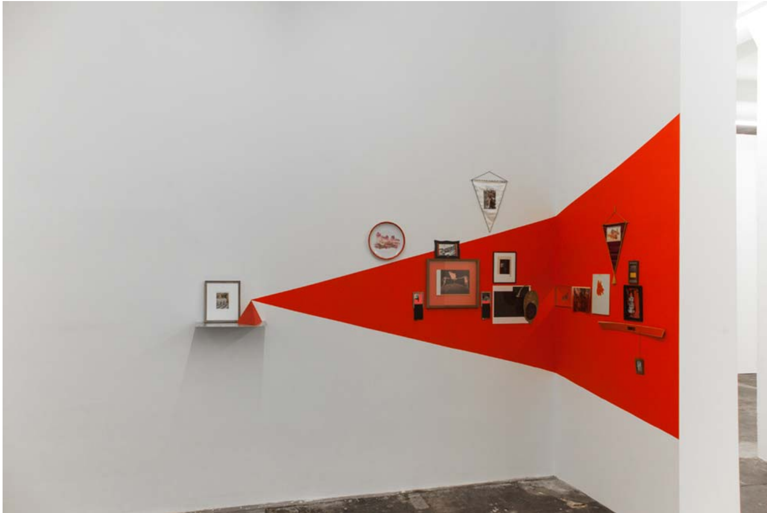
Svätopluk Mikyta, installation view Gallery Plan B, Berlin 2012

K R O K U S Galéria s.r.o., Námestie 1. mája 3, SK-811 06 Bratislava T/F + 00421 (0)2 207 28 131, office@krokusgaleria.sk, www.krokusgaleria.sk Open Mo.-Fr. 14.00-18.00