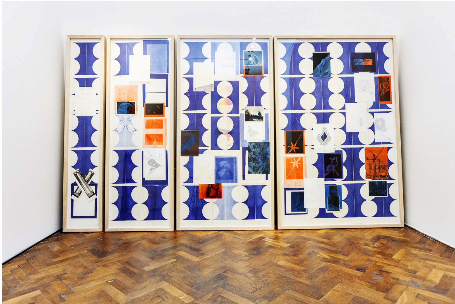
Svätopluk Mikyta, Curtain I-IV, installation view Krokus Gallery Bratislava 2013

K R O K U S Galéria s.r.o., Námestie 1. mája 3, SK-811 06 Bratislava T/F + 00421 (0)2 207 28 131, office@krokusgaleria.sk, www.krokusgaleria.sk Open Mo.-Fr. 14.00-18.00