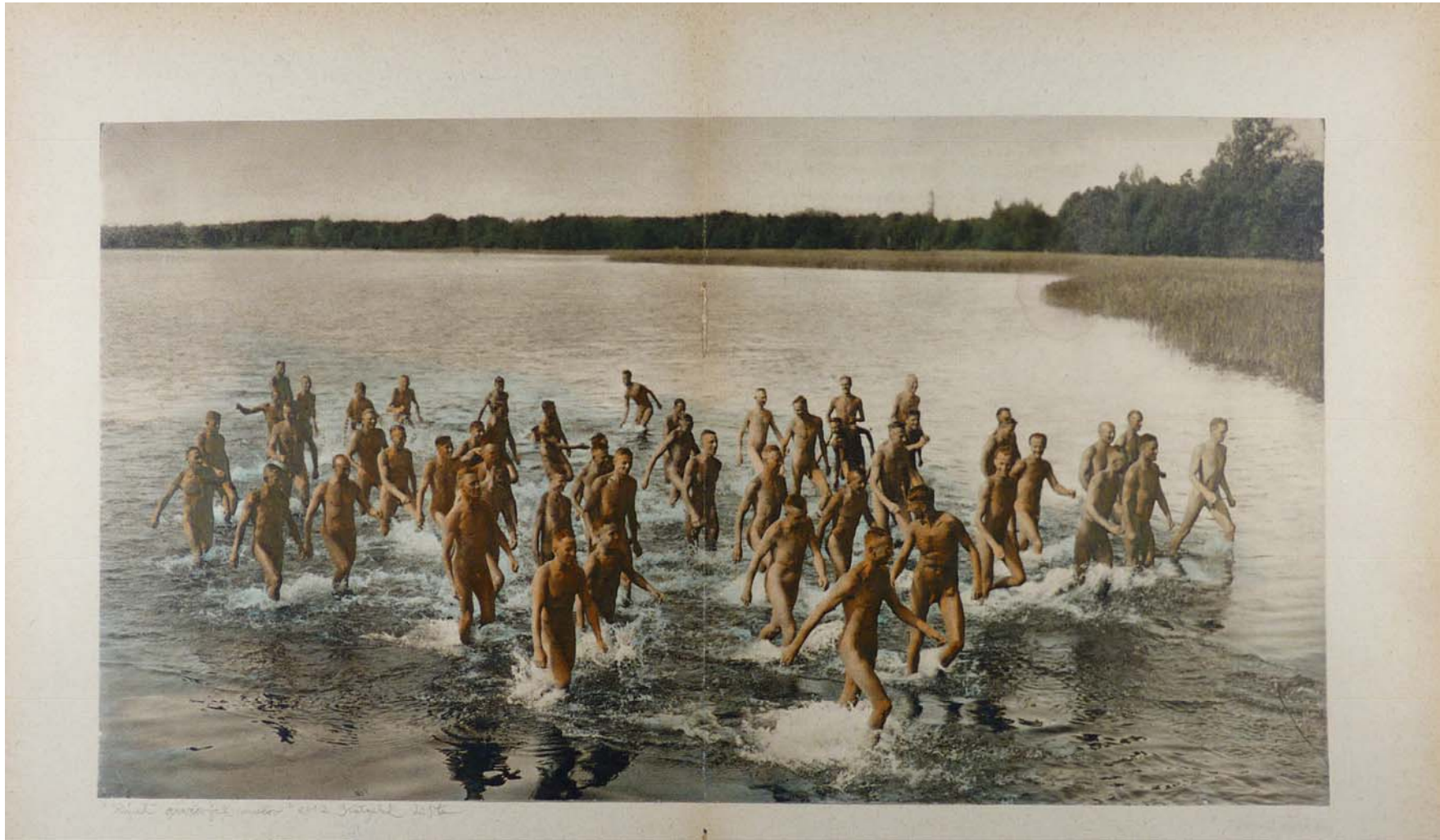
Svätopluk Mikyta, from the series Orange Human, mixed media on paper, 2013

K R O K U S Galéria s.r.o., Námestie 1. mája 3, SK-811 06 Bratislava T/F + 00421 (0)2 207 28 131, office@krokusgaleria.sk, www.krokusgaleria.sk Open Mo.-Fr. 14.00-18.00