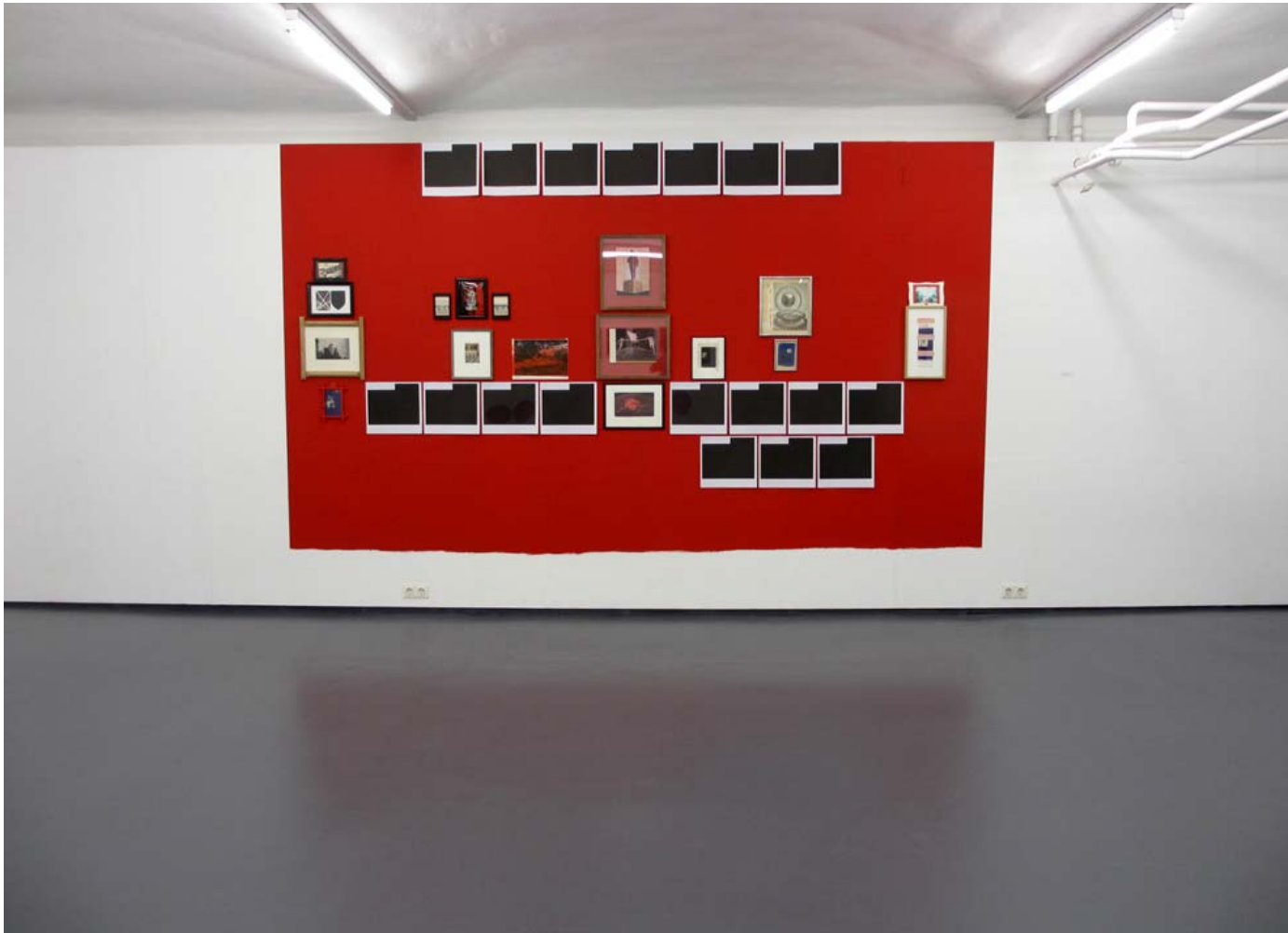
Svätopluk Mikyta, installation view, Fotogalerie Wien, 2012

K R O K U S Galéria s.r.o., Námestie 1. mája 3, SK-811 06 Bratislava T/F + 00421 (0)2 207 28 131, office@krokusgaleria.sk, www.krokusgaleria.sk Open Mo.-Fr. 14.00-18.00